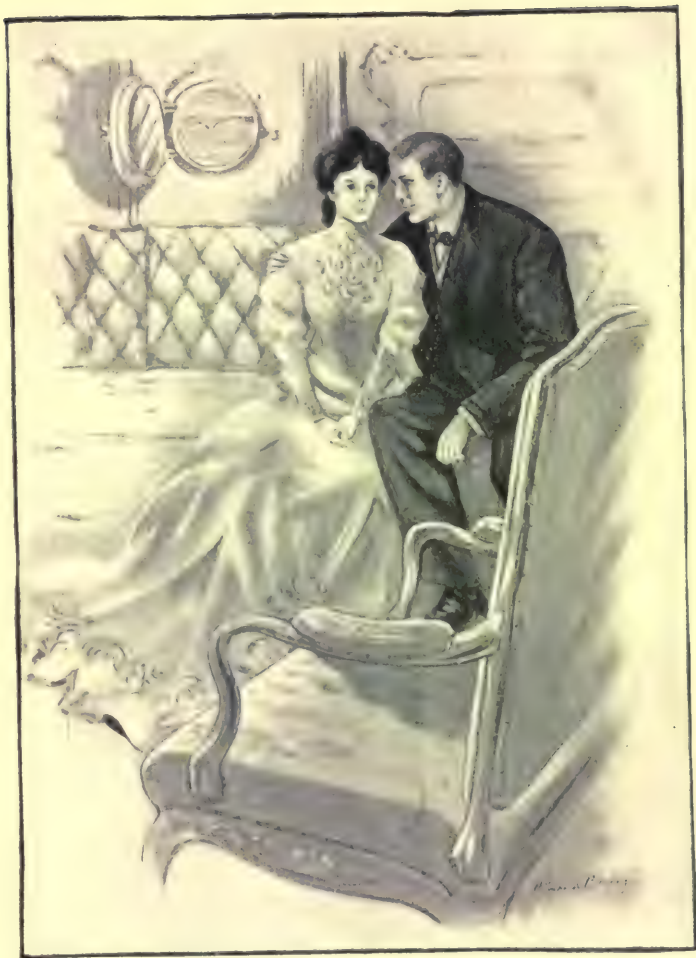
THERE THEY SAT TOGETHER, OUT OF SIGHT OF THE STAIRWAY.—Page 318